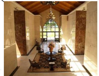
MAUSOLEUM Single, Companion and Family Casket Entombments